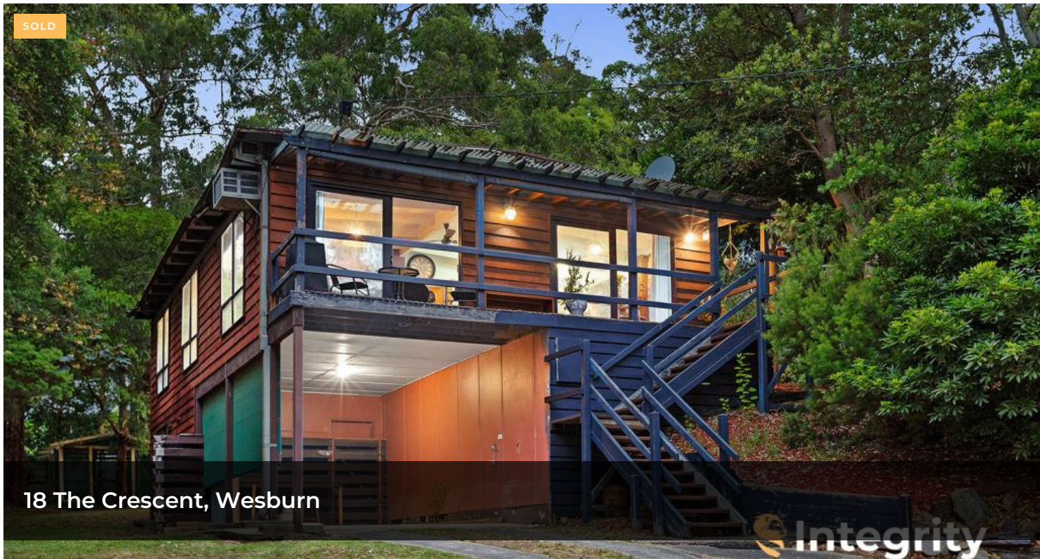
18 The Crescent, Wesburn